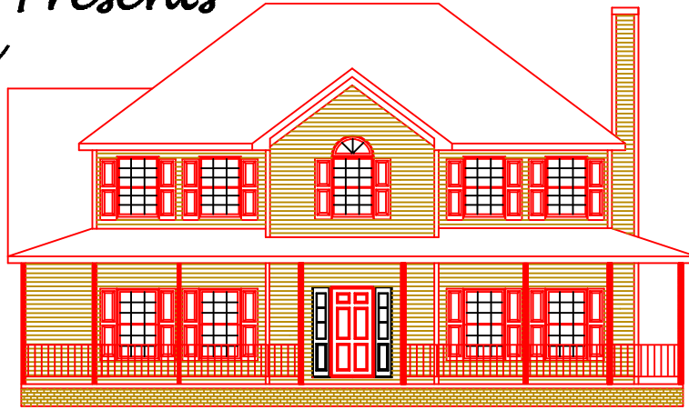
Image Homes Presents The Richland